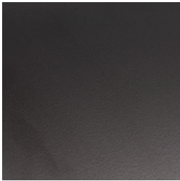
POWDER COATED STEEL *RAL COLORS